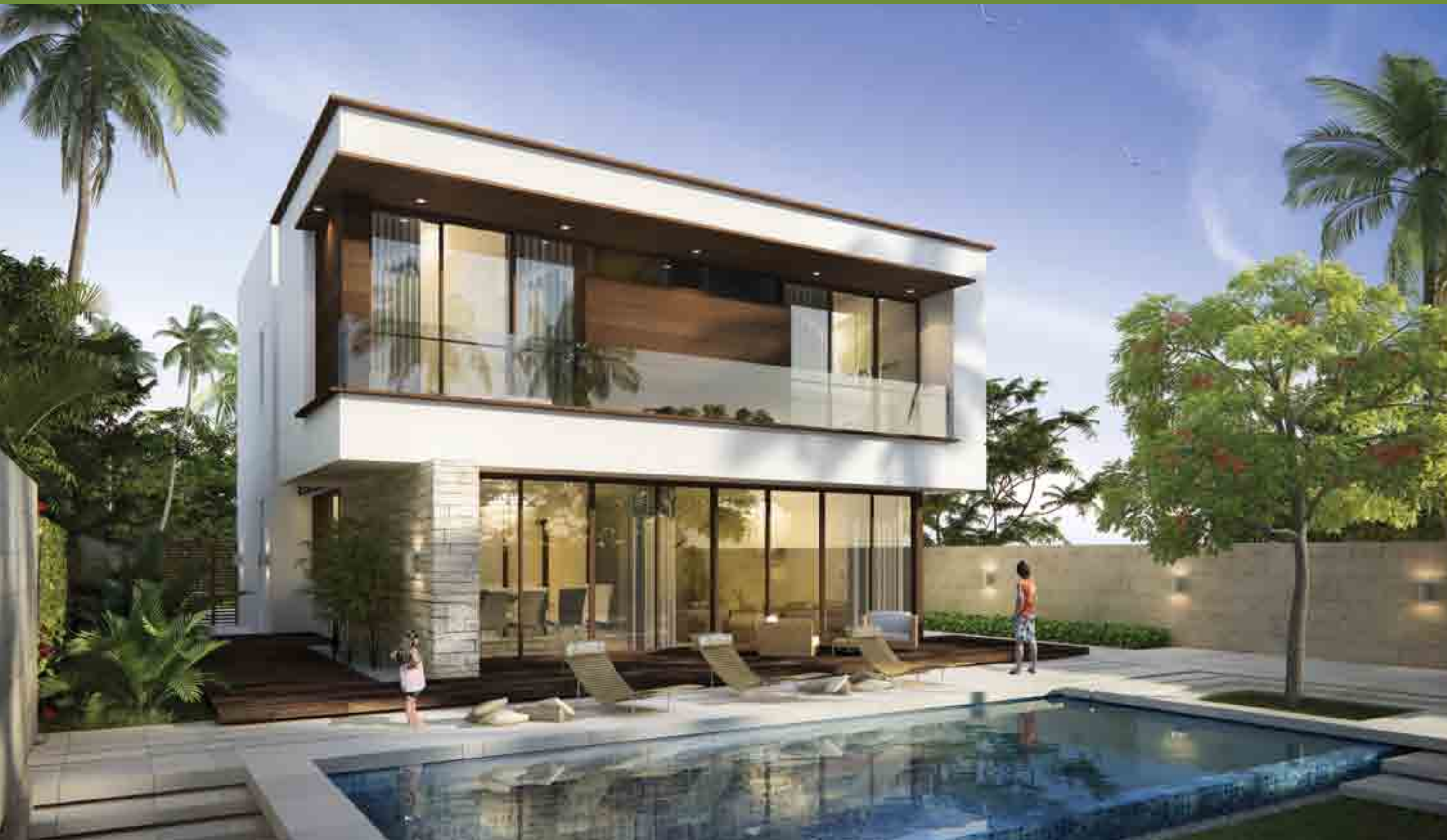
VILLA TYPE V4