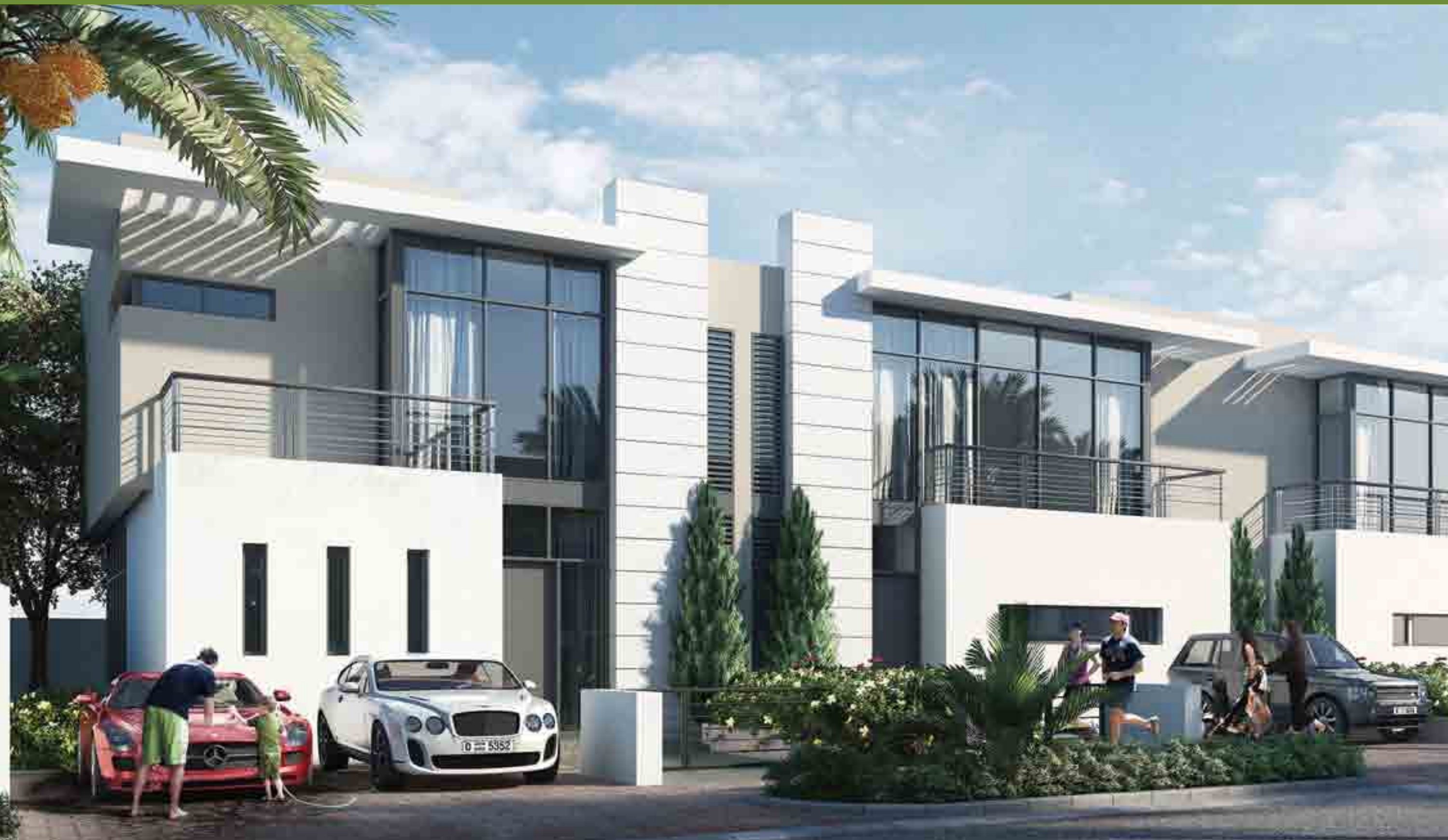
VILLA TYPE TH-E/M