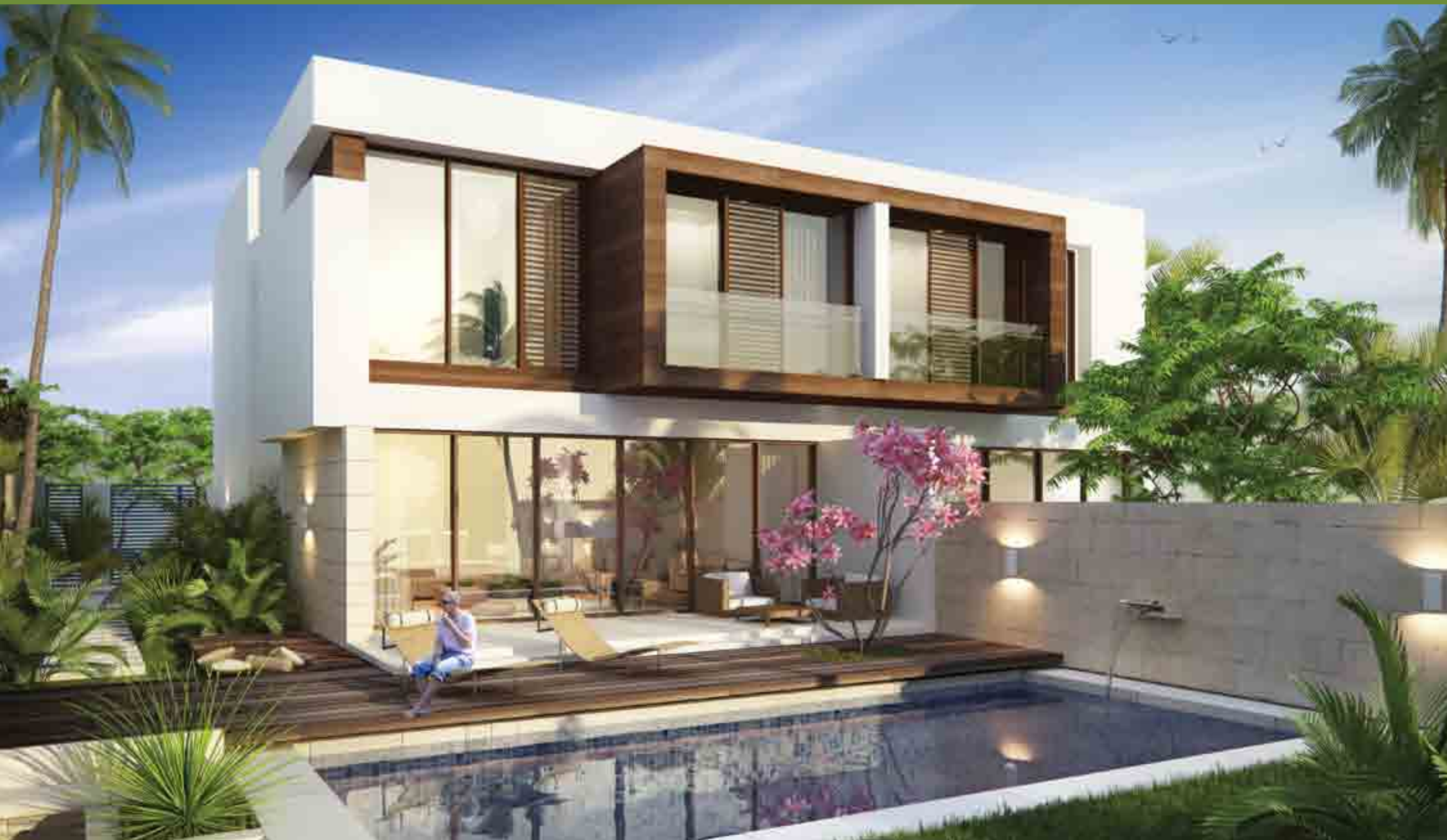
VILLA TYPE TH-L